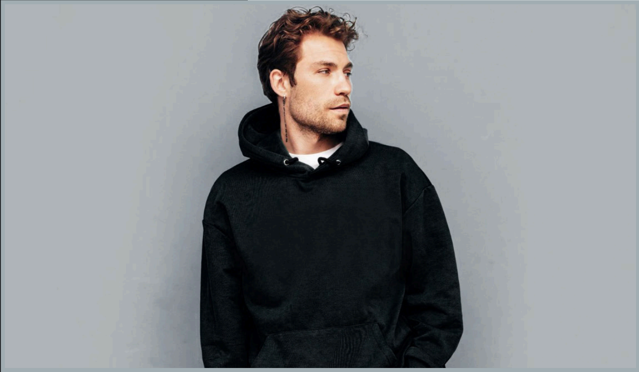
PREMIUM PULLOVER HOODIE CA14001 COLOR SHOWN: BLACK