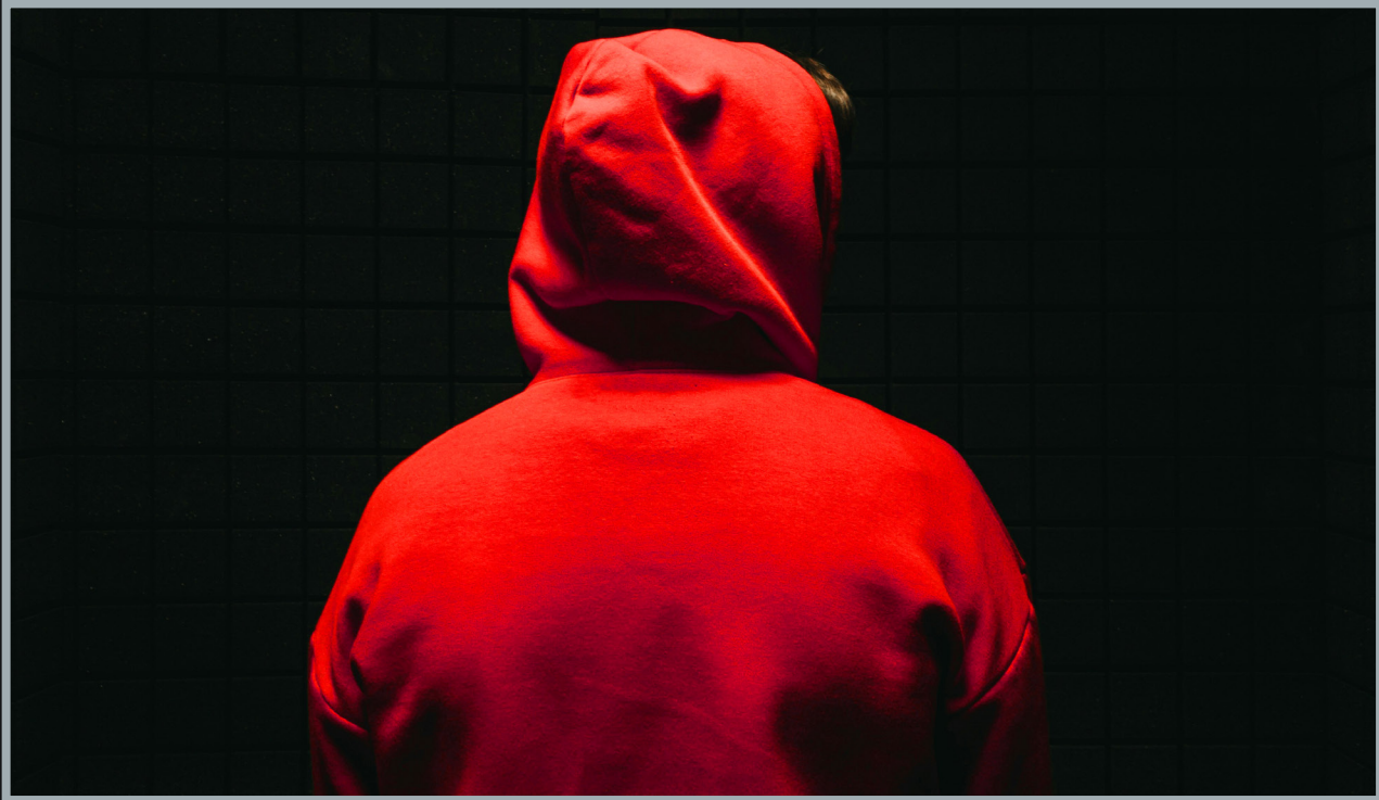
HEAVYWEIGHT PULLOVER HOODIE CA19001 COLOR SHOWN: RED

HEAVYWEIGHT PULLOVER HOODIE CA19001 COLOR SHOWN: HEATHER GREY